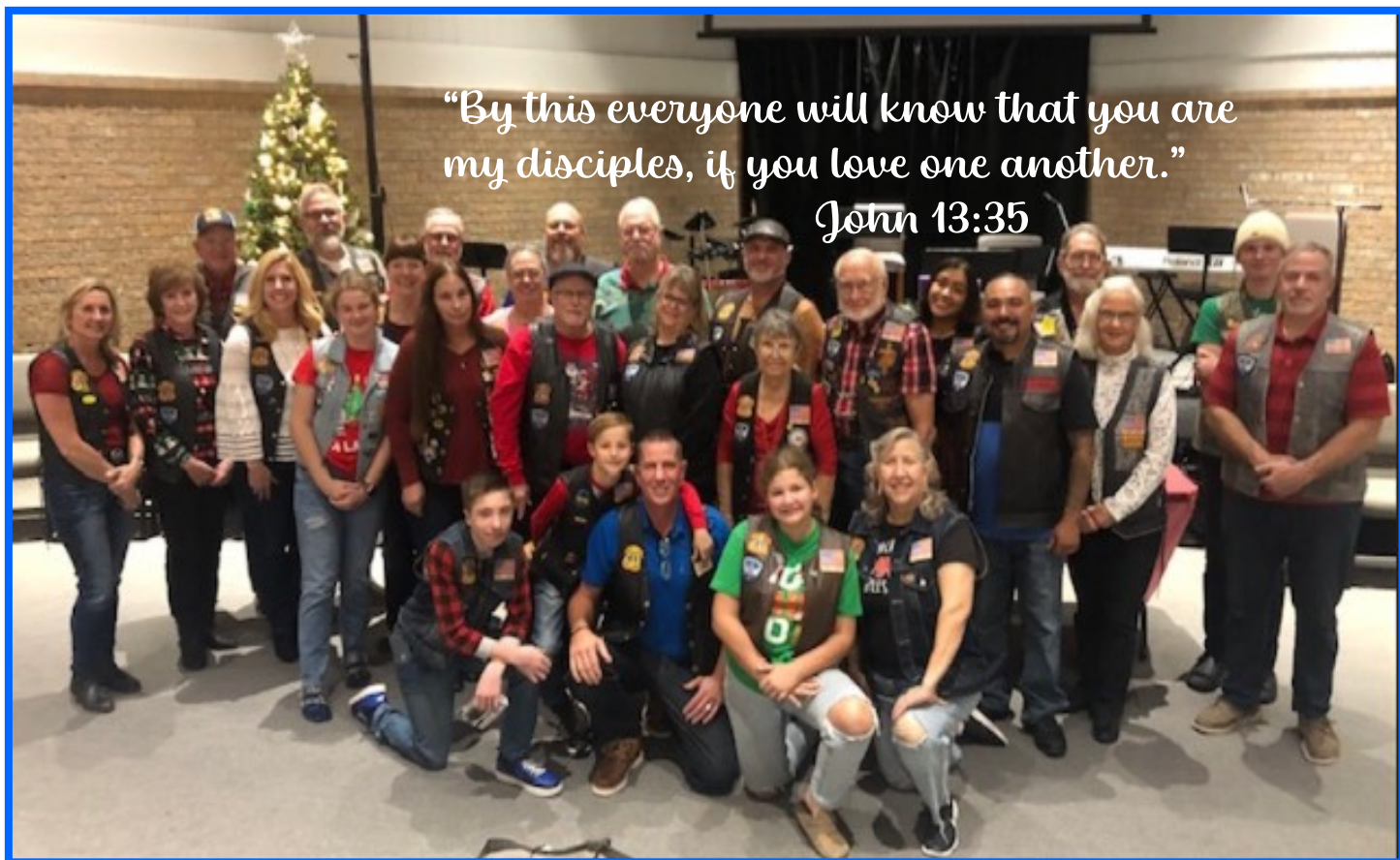
Christian Motorcyclists Association

CMA GodSpeed Riders Webpage CHAPTER #1295, Clear Lake TX godspeerriders@gmail.com