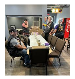
RFS Fundraiser - Mod Pizza